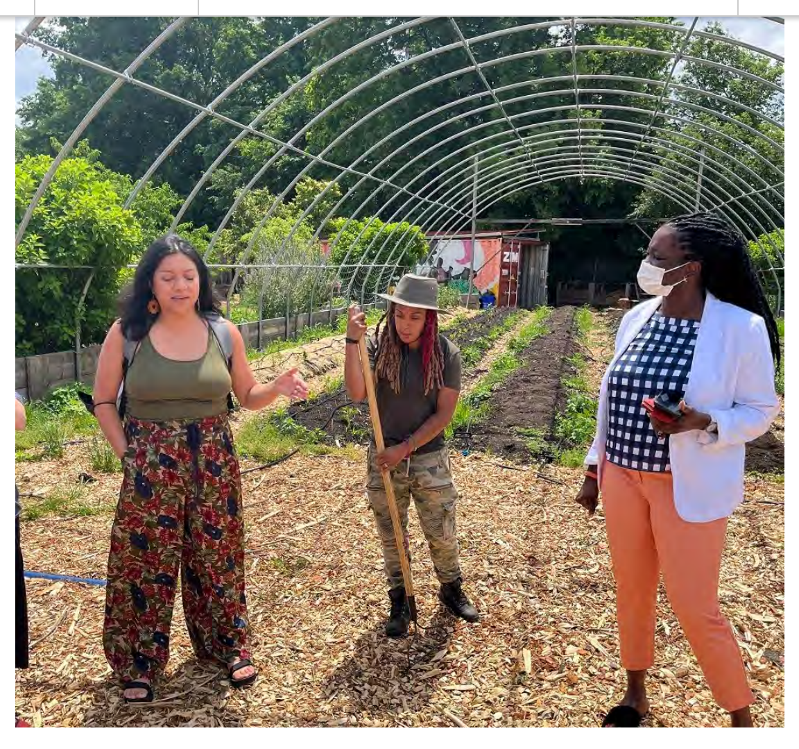
Learning about the legacy of environmental damage in Newark's Ironbound neighborhood at Down Bottom Farms community garden.