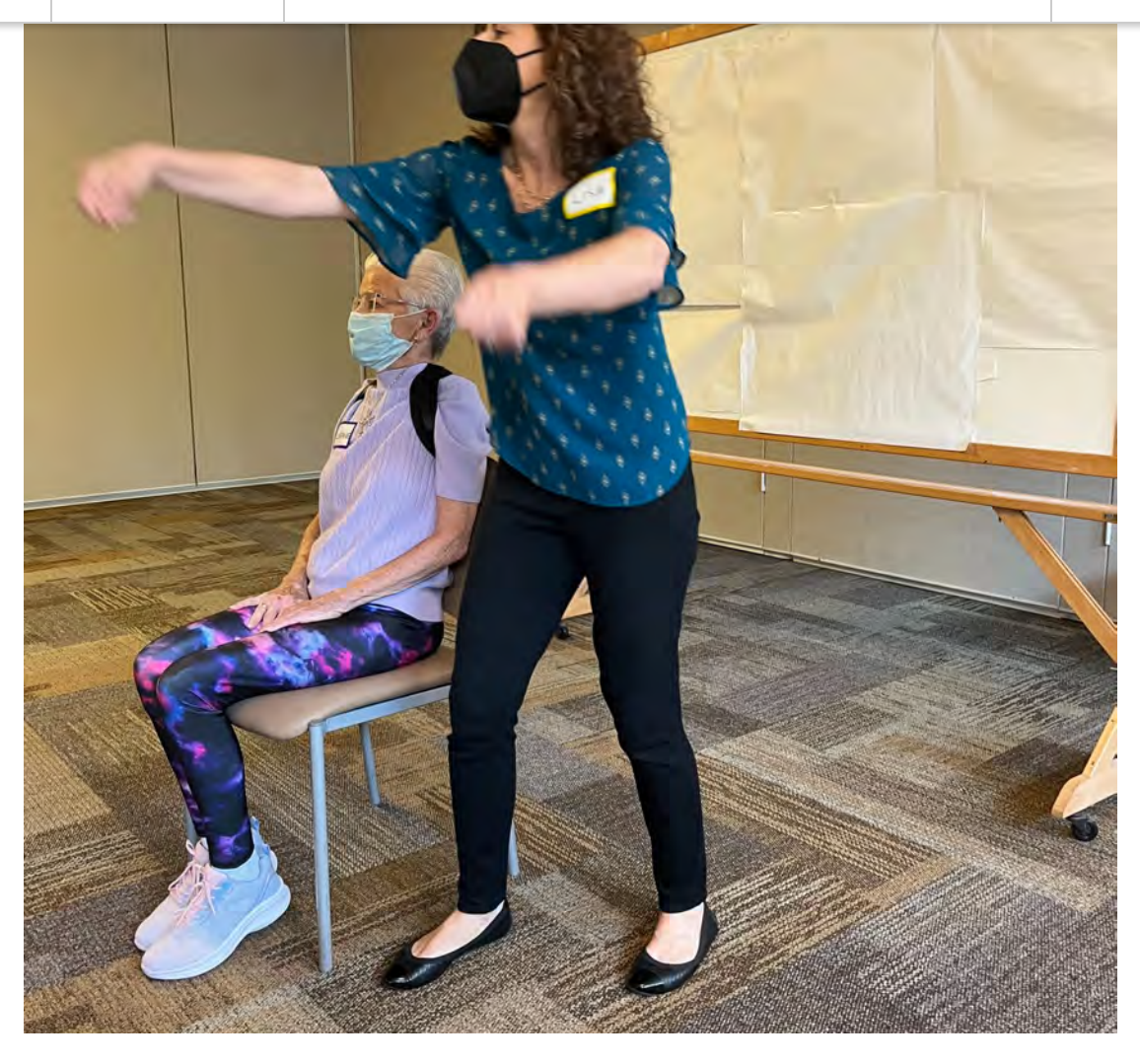
A staff member and client engage in a game at Jewish Family Service of Central NJ's Coffee House program for seniors with mild dementia, Scotch Plains.