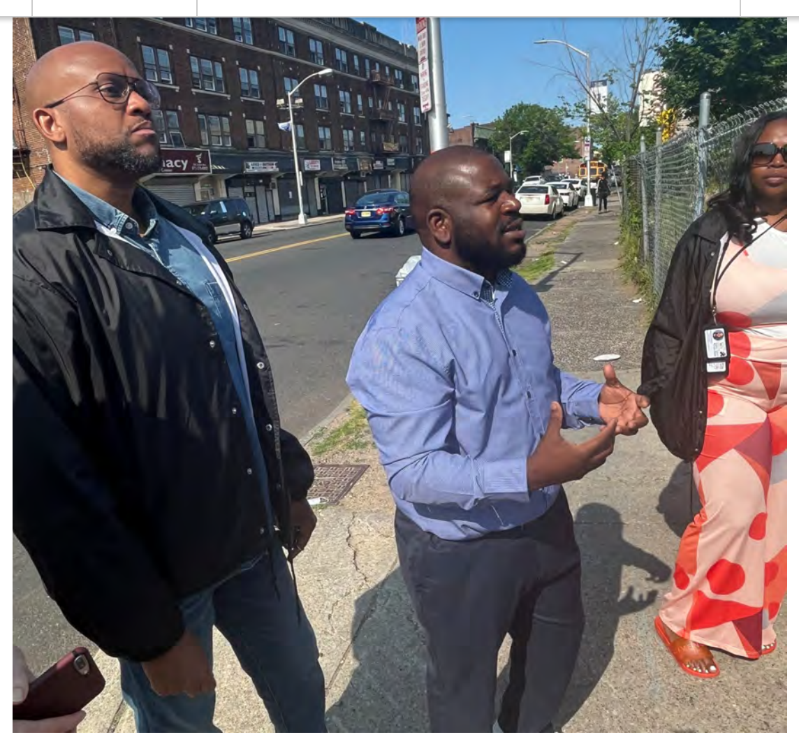
On the ground in Newark's South Ward with the Newark Community Street Team.