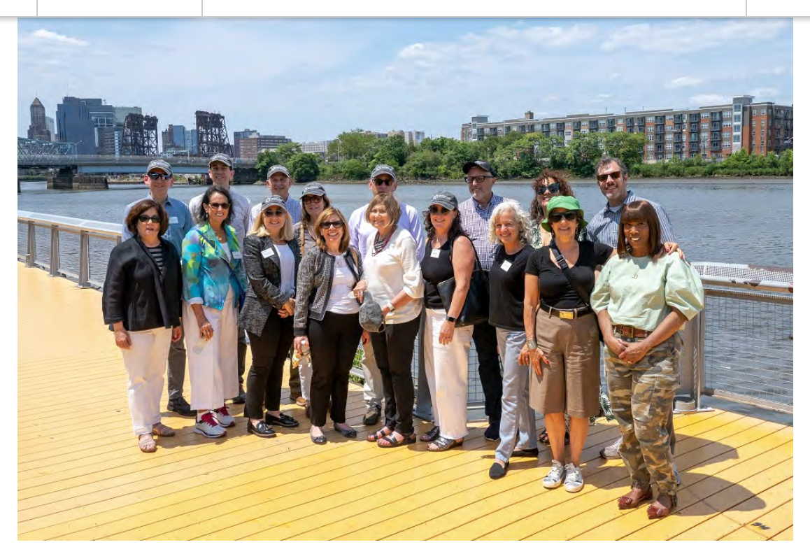
During a listening tour with grantee partners, trustees and staff learned about the restoration of Newark's Riverfront Park with the Trust for Public Land.