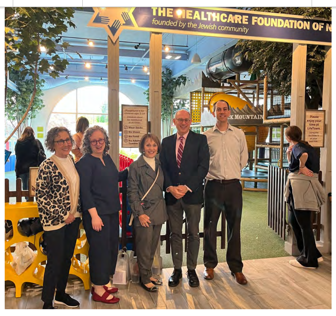
Visiting Friendship Cicle's Lifetown complex in Livingston, NJ.